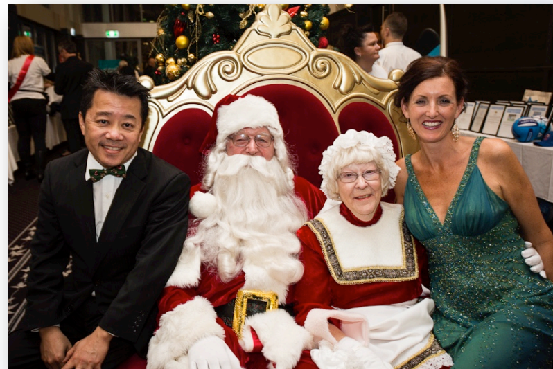
Santa and Mrs Claus post with guests at the 2019 Christmas in July Charity Ball