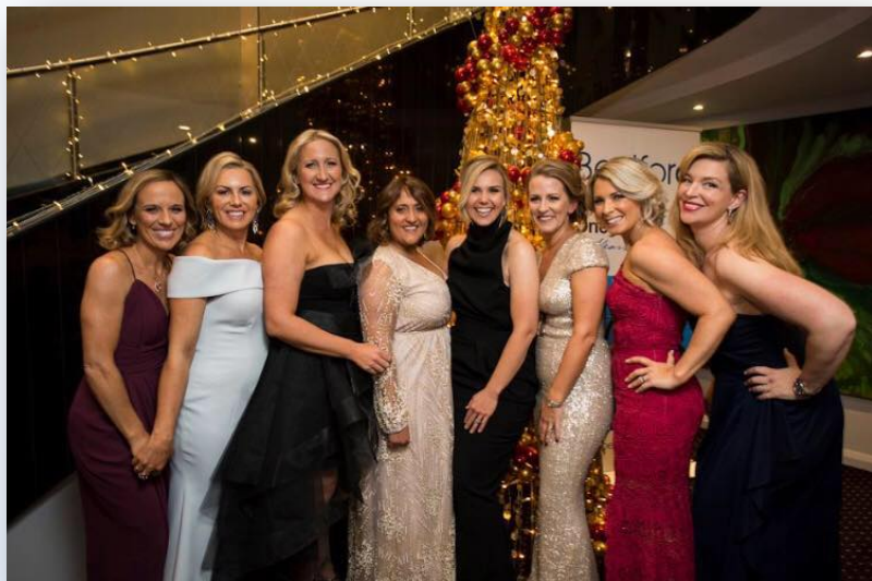
The FOTB Executive Committee with the 2019 Christmas in July Charity Ball Emcee – Edwina Bartholomew

In 2019, the Christmas in July Charity Ball will be held on Friday 5 th July at the Miramare Gardens, Terrey Hills. The goal is to raise another $300,000 for cancer research and we invite you to join us in our mission.